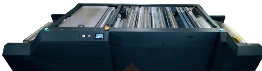
POLYMOUNT FILM CLEANER

The cleaned film can also be fully recycled using a shredding and regranulation process that converts it back into pellets for use in film extrusion. Plastic waste needs to be reduced as much as possible. The Polymount Film Cleaner offers Flexo and Gravure printers a very economical and sustainable method to reduce their plastic waste. Our futures depend on creating a circular economy. The Polymount Film Cleaner contributes to those principles and actually creates value out of your waste. A win win situation.